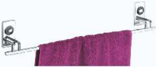
Z1010116 TOWEL ROD ₹ 973/-