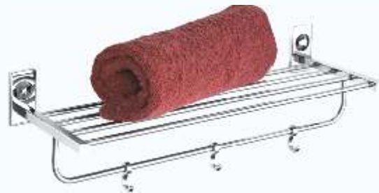
Z1010121 TOWEL RACK ₹ 3003/-