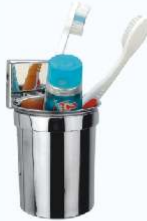
F6210102 TUMBLER HOLDER ₹993