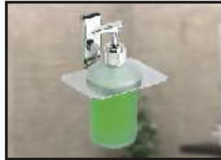
SS304 Grade Bath Fitting 07-16