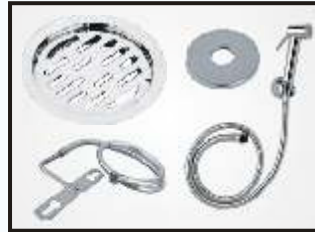
Brass Flange, Jet Spray Health Faucets, Jali - 17