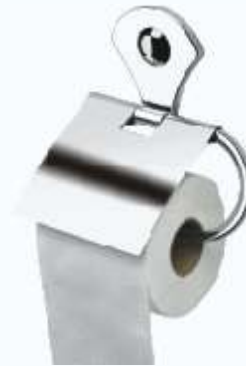
Z1010131 PAPER HOLDER ₹ 1063/-