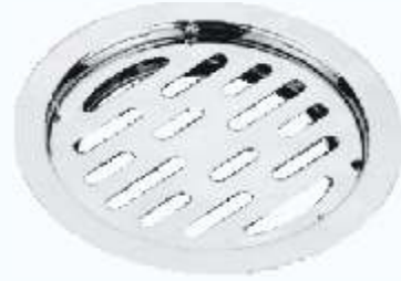
5" J2451011 Lock jali ₹193