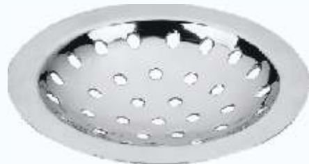
JALI ROUND PLAIN