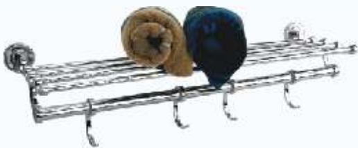
F5810106 TOWEL RACK ₹4723