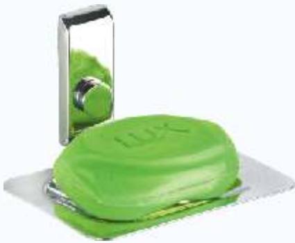
Z1010103 TUMBLER HOLDER ₹ 643/-