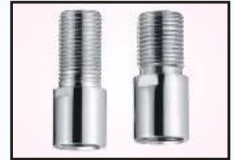
Brass Extension Nipple - 18