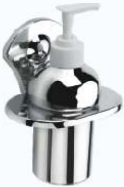
Z1010130 SOAP DISPENSER ₹ 1183/-