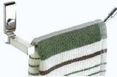
Z1010104 TOWEL RING ₹ 603/-