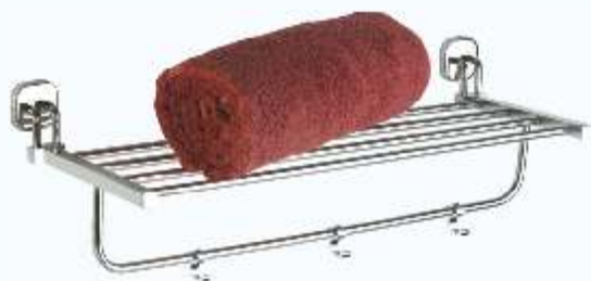
Z1010113 TOWEL RACK ₹ 3033/-