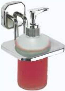
Z1010114 SOAP DISPENSER ₹ 1183/-