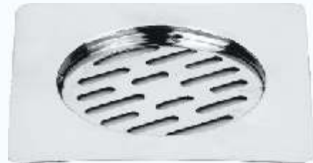
5" J2451012 Lock jali with frame ₹213