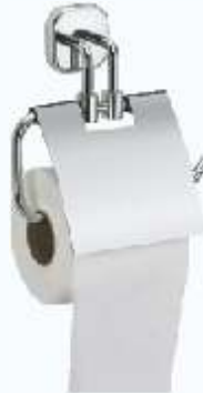
Z1010115 PAPER HOLDER ₹ 1113/-