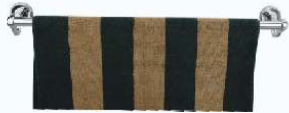
F5810105 TOWEL ROD ₹1903