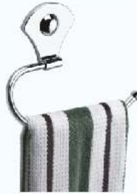
Z1010127 TOWEL RING ₹ 773/-