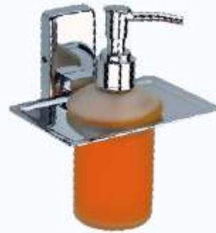
Z1010138 SOAP DISPENSER ₹ 1143/-