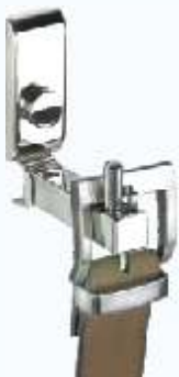
Z1010105 COAT HOOK ₹ 333/-