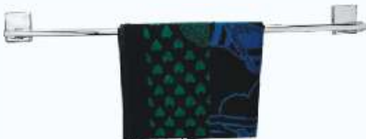
F6210105 TOWEL ROD ₹1823