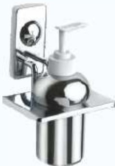
Z1010117 SOAP DISH ₹ 593/-