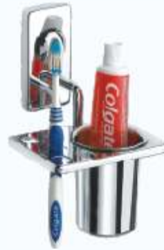
Z1010122 SOAP DISPENSER ₹ 1143/-