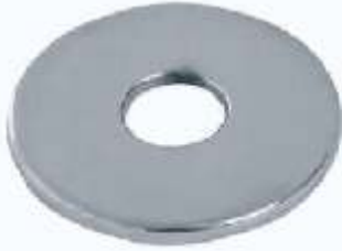
G1010101 Round CP Flange ₹ 53