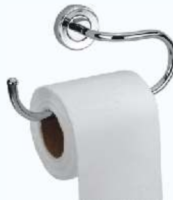
F5810107 PEPER HOLDER ₹883