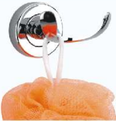
F5810103 ROBE HOOK ₹653