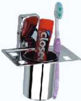
Z1010134 TUMBLER HOLDER ₹ 873/-