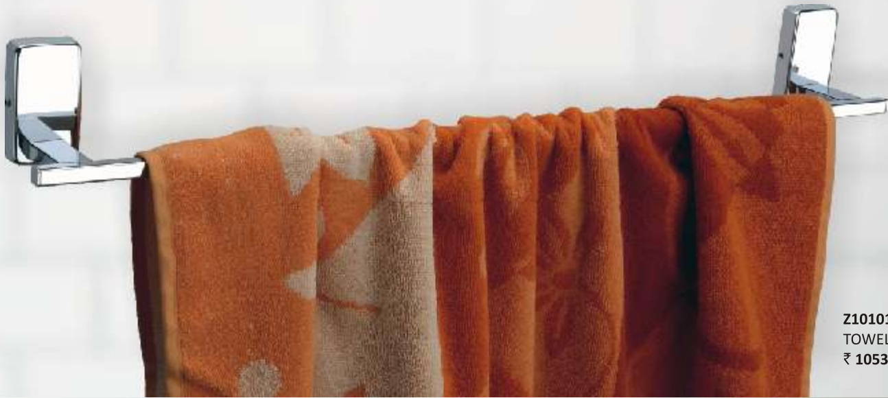
Z1010132 TOWEL ROD ₹ 1053/-