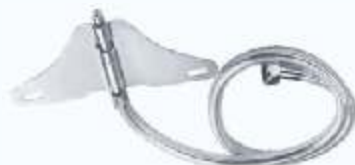
B7010102 JET SPRAY STRAIGHT ₹523