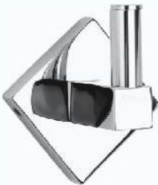
F2210103 ROBE HOOK ₹813