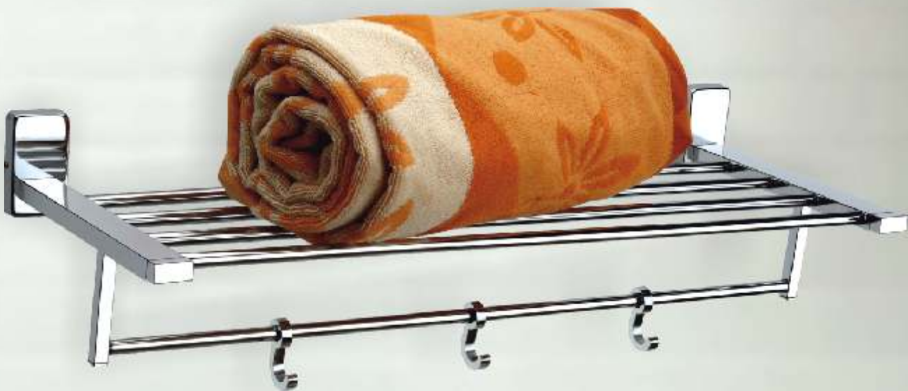
Z1010137 TOWEL RACK ₹ 2963/-