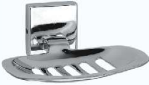
F6210101 SOAP DISH ₹1023