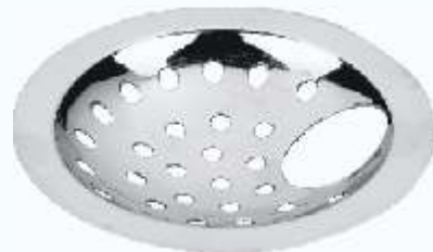
JALI ROUND HOLE