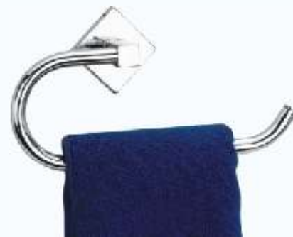
F2210104 TOWEL RING ₹1313