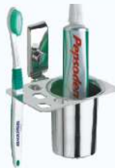
Z1010102 SOAP DISH ₹ 473/-