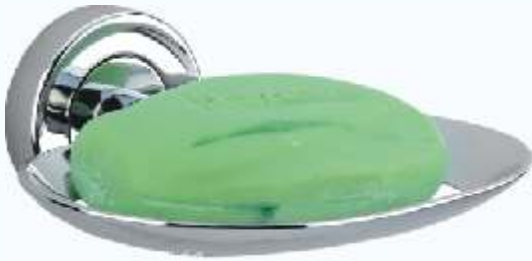
F5810101 SOAP DISH ₹943