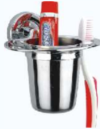
F5810102 TUMBLER HOLDER ₹1153