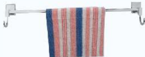
F6210106 TOWEL ROD WITH HOOK ₹2033