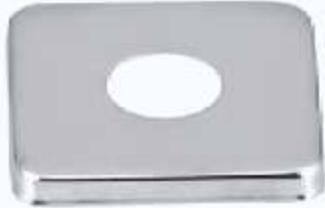
G1010102 Square CP Flange ₹ 83