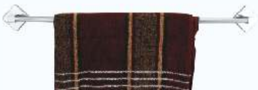
F2210105 TOWEL RING ₹2133