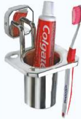
Z1010110 TUMBLER HOLDER ₹ 703/-