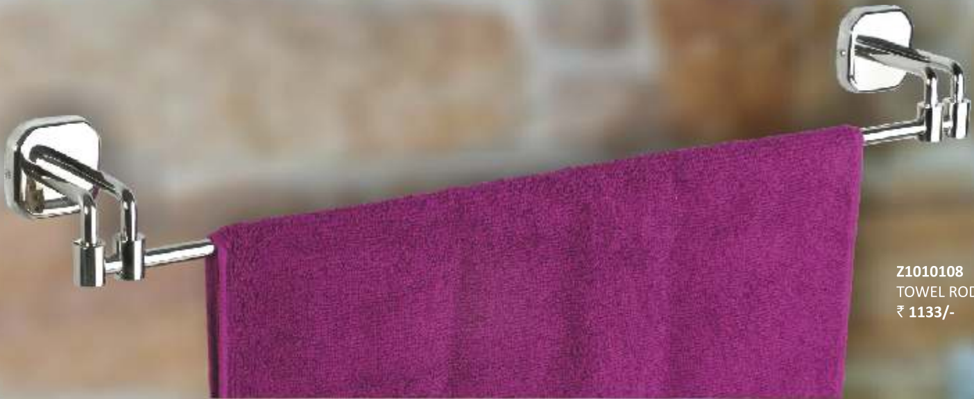
Z1010108 TOWEL ROD ₹ 1133/-