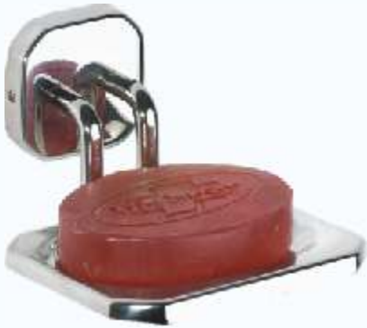
Z1010109 SOAP DISH ₹ 593/-