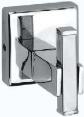
F6210103 ROBE HOOK ₹693