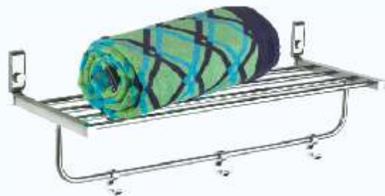
Z1010106 TOWEL RACK ₹ 3563/-