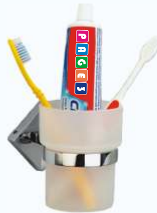
F2210102 TUMBLER HOLDER ₹1013