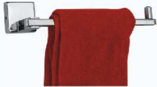
F6210104 TOWEL RING ₹923