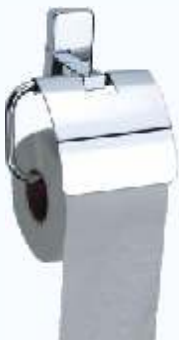
Z1010139 PAPER HOLDER ₹ 943/-