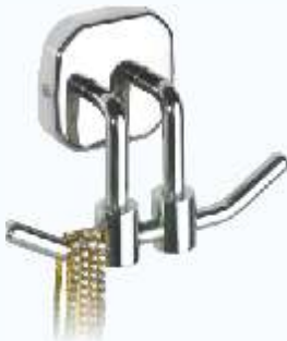
Z1010112 COAT HOOK ₹ 643/-