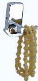
Z1010136 COAT HOOK ₹ 453/-