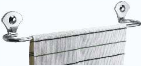
Z1010124 TOWEL ROD ₹ 1103/-