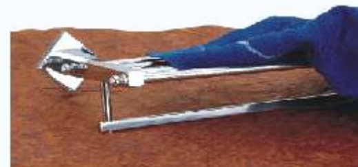
F2210106 TOWEL RACK ₹5633