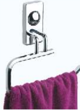
Z1010118 TUMBLER HOLDER ₹ 703/-