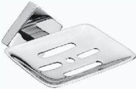
F2210101 SOAP DISH ₹1053