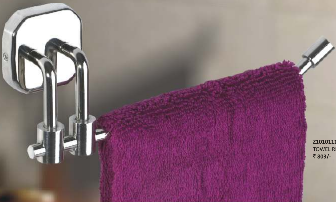
Z1010111 TOWEL RING ₹ 803/-