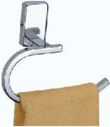
Z1010135 TOWEL RING ₹ 663/-