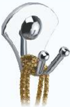
Z1010128 COAT HOOK ₹ 403/-