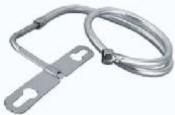
B7010101 JET SPRAY MULTI ₹503