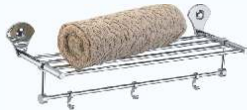
Z1010129 TOWEL RACK ₹ 2563/-