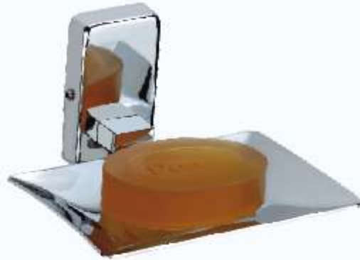
Z1010133 SOAP DISH ₹ 743/-