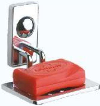
Z1010119 TOWEL RING ₹ 563/-