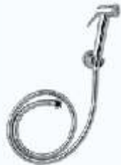
B7010104 BRASS HEALTH FAUCET (1.0 Meter Housing Pipe) ₹1053