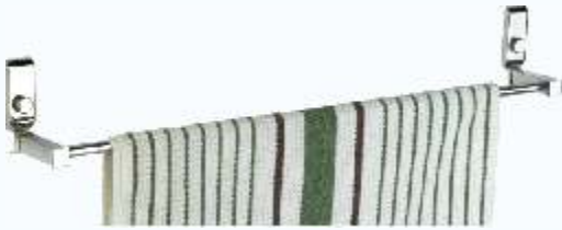
Z1010101 TOWEL ROD ₹ 833/-